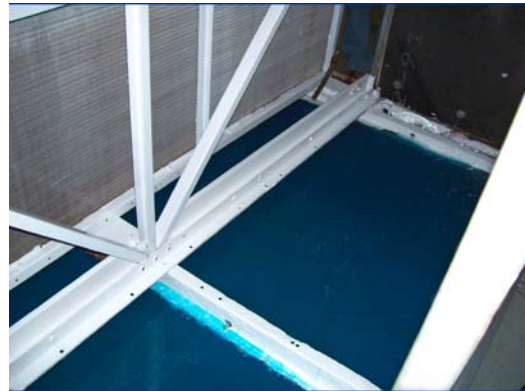
Typical Completed Pancrete Application for Pans & Horizontal Supports